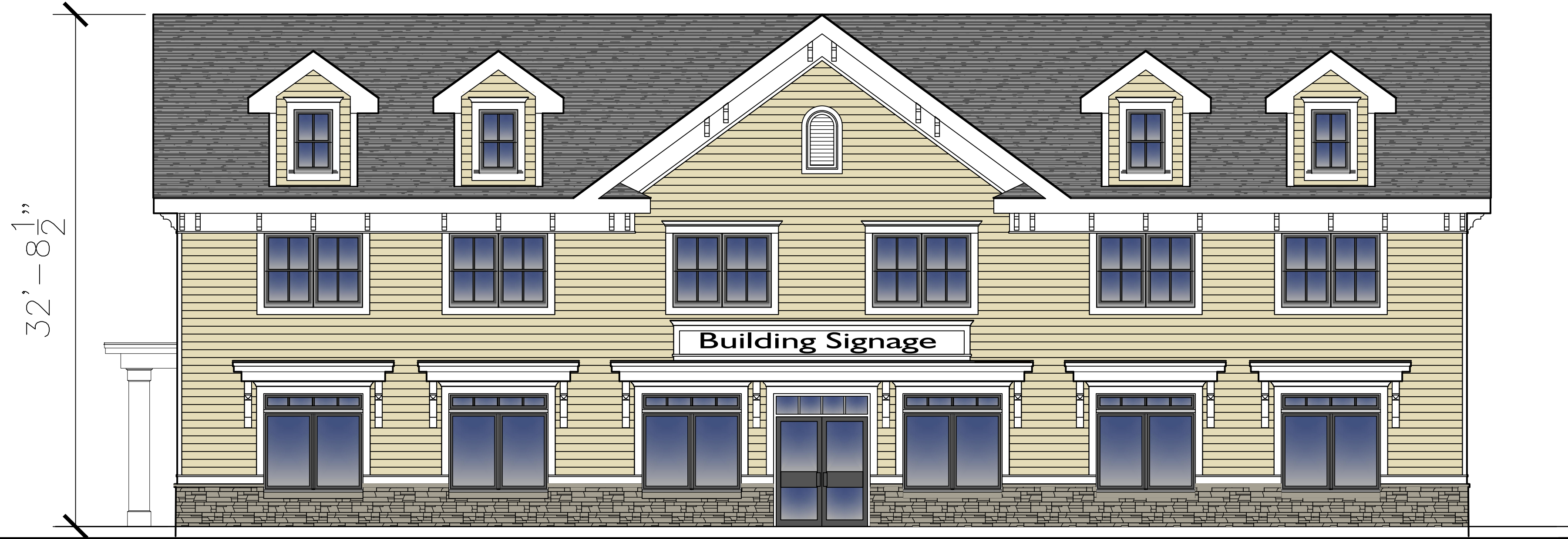
NORTH ELEVATION SCALE: 3/16" = 1'-0"