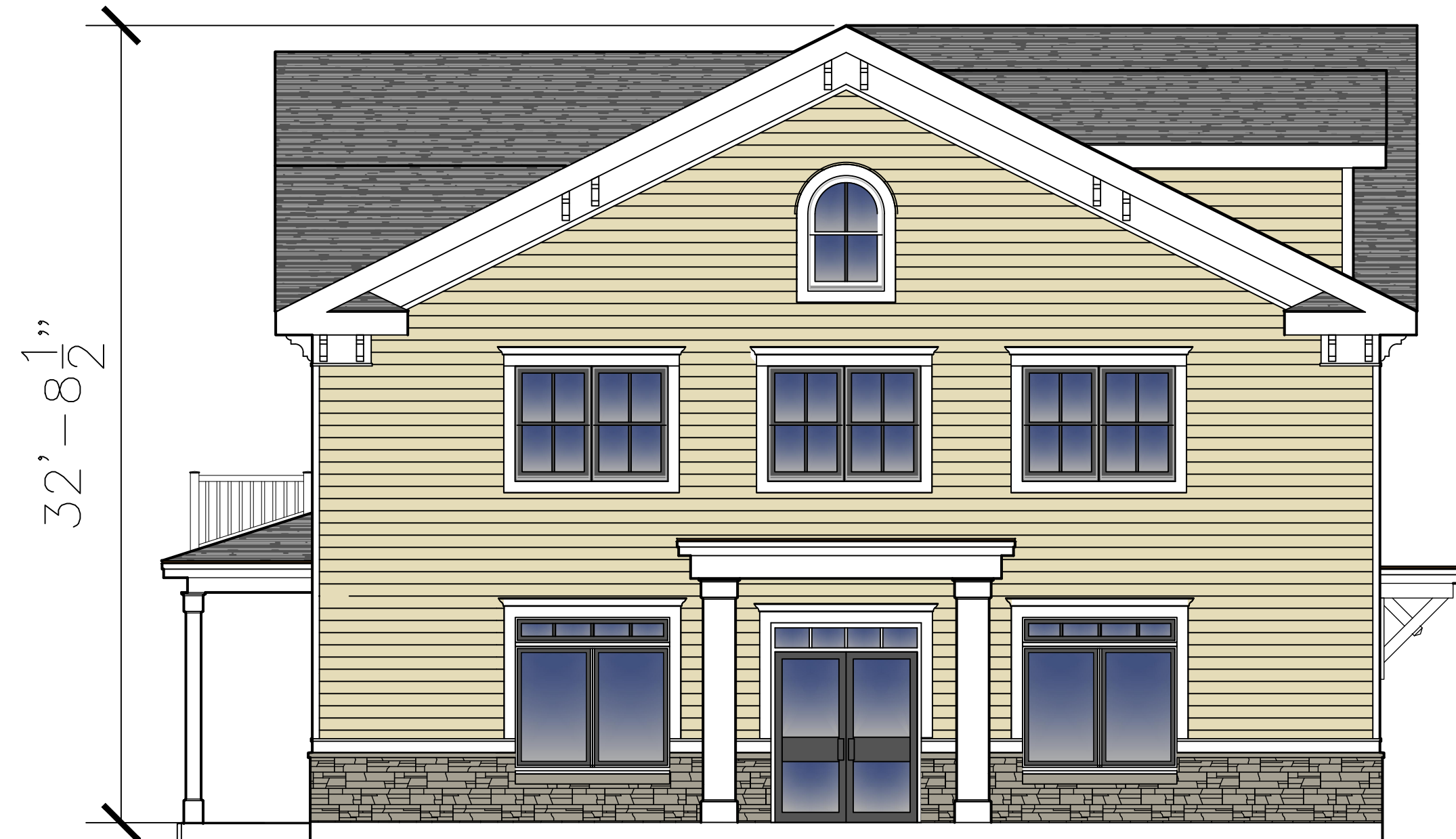
EAST ELEVATION SCALE: 3/16" = 1'-0"