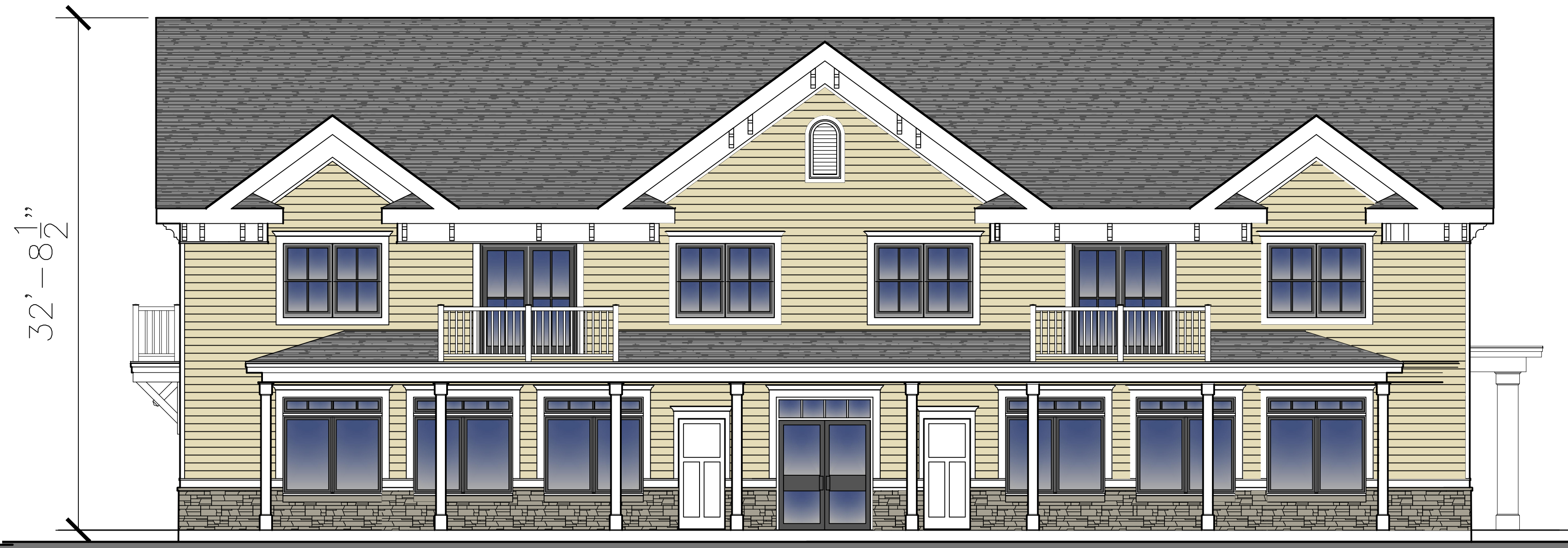
SOUTH ELEVATION SCALE: 3/16" = 1'-0"