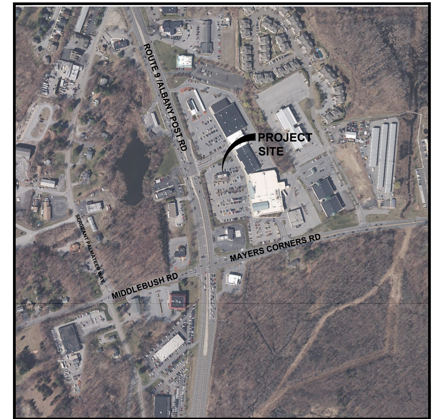
LOCATION MAP SCALE: 1"=400'

SITE DEVELOPMENT PLANS - FOR REVIEW ONLY